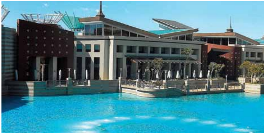
The new Silver Star Casino on the West Rand is one of many new prestige projects for which a.b.e. products were specified.

For more information contact Elrene Smuts on 011-306-9000 or visit: www.abe.co.za