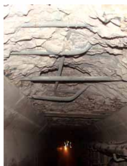
Four a.b.e. products were specified for the concrete repair work in Durban harbour's Pier 1 tunnel.

"a.b.e.'s duraflex flexible waterproofing slurry was also applied to all internal walls and floors of the tunnel to prevent the sea-water from penetrating the tunnel on the edge of the pier. All joints were subsequently sealed with durakol G HM sealant," De Kock adds. durakol G HM is a gun-grade, two component, manganese cured polysulphide sealant.