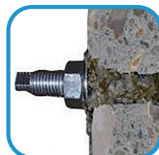
ANCHOR RODS IN SOLID CONCRETE