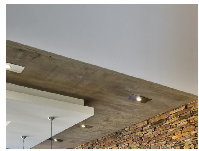
durarep FC is ideal for use as a scraper coat and filling minor indentations. Filing blowholes.