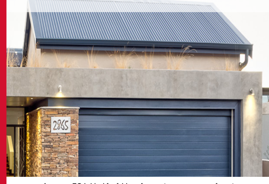
durarep FC is ideal for fairing of concrete or masonry surfaces to receive protective or decorative coatings. highly compatible with and bonds extremely well to concrete, masonry, and other durarep FC mortars and can be over-coated with duracote coatings.